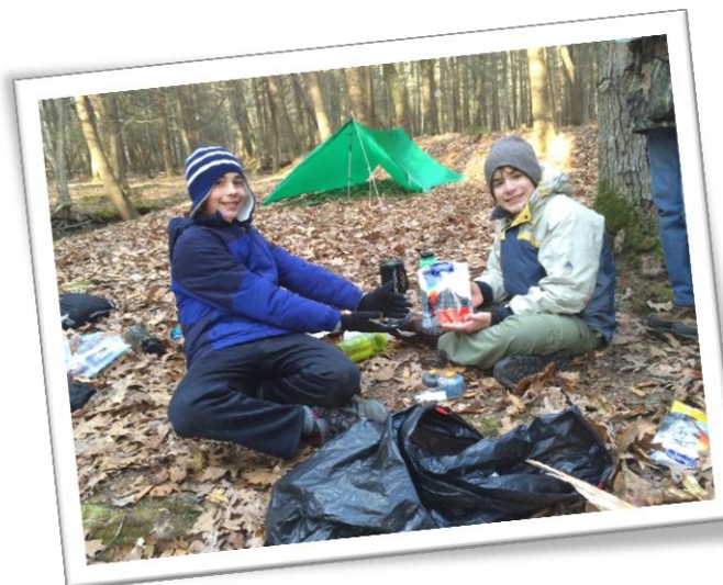
Backpacking is fun—even on the coldest night in March!