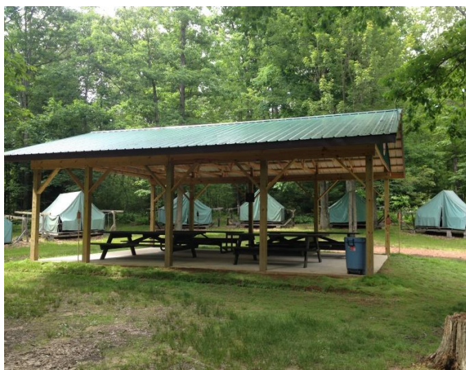
Pictured above is the new pavilion built in the Leopold campsite at Seven Mountains.