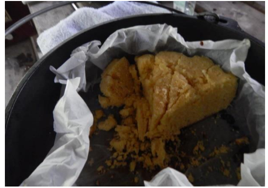
Cornbread from Cherry Springs Campout.

Cherry Springs State Park is nearly as remote and wild as it was in the days of William Penn. Its exceptionally dark skies make it one of the best places on the Eastern seaboard for stargazing. Though the rain made it difficult to view the stars during the Black Forest Star Party, scouts made the most of the weekend and had some great food. See the cornbread pictured at right!