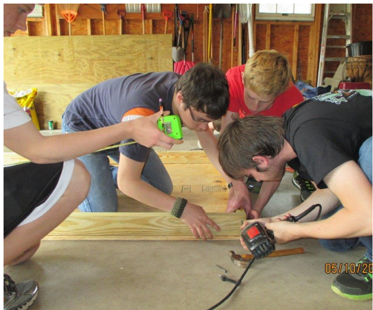
Jordan and crew work together to build and erect the shelter. The project totaled about 252 hours of service.