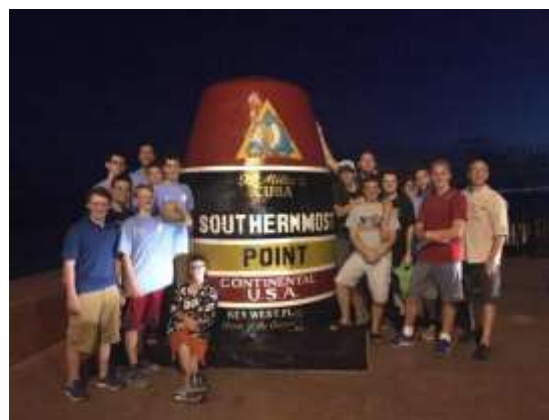
We sent 4 crews to the Florida Sea Base High Adventure. Check out some of the fun they had on their pre-trek activities and during their Out Island and Sailing Adventures.