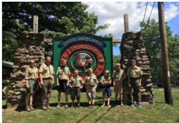
Above: Scouts who attended 7 Mountains this summer. Below: Scouts at Bashore