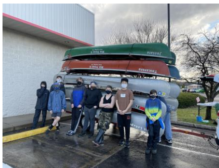
Canoe cleanup, 3/28/21