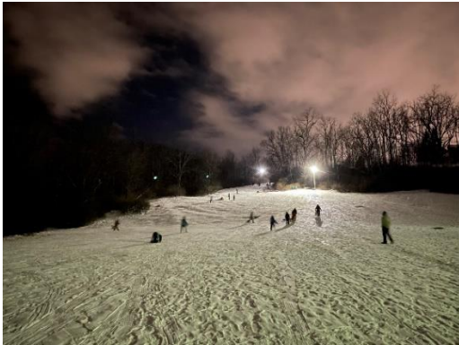
Sledding at Slab Cabin, 2/9/21