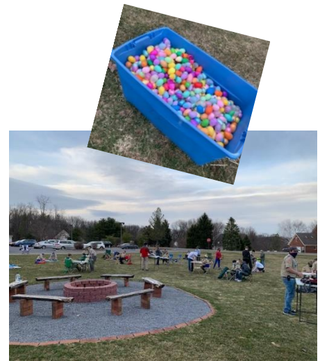
Egg stuffing, Good Shepherd Catholic Church, 3/23/21