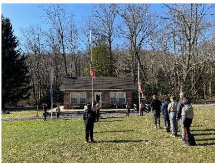
Flag retirement ceremony, Survival Skills Campout 3/20/21