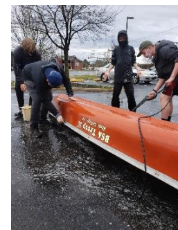
Canoe cleanup, 3/28/21