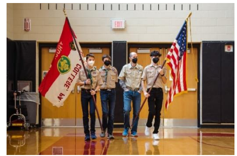
Elks Hoop Shoot Flag Ceremony, 3/6/22