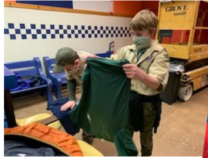
Laundry Night, 2/8/22