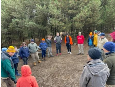
Hickory Run State Park