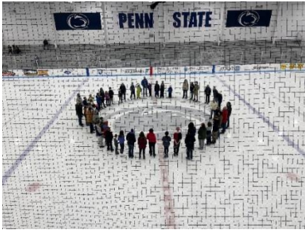
Ice skating @ Pegula, 12/14/21, photo by Kevin LeVan