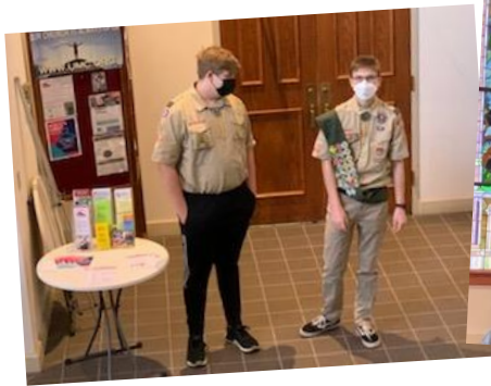
Scout Sunday, 2/13/22