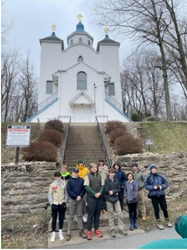
Mystery stop #1