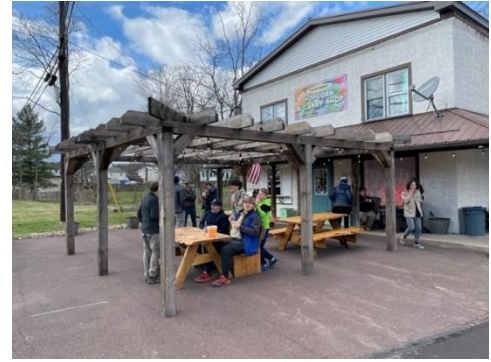
Mystery stop #3