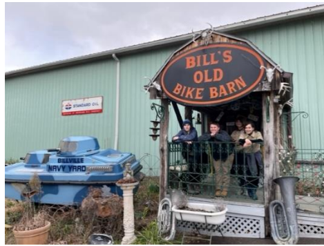
Mystery stop #2