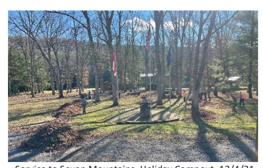
Service to Seven Mountains, Holiday Campout, 12/4/21