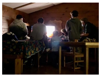
Video game playing, Holiday Campout, 12/4/21