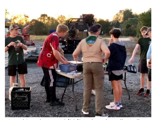
Patrol Box cleanout, 9/28/21, photo by Kelly Walker