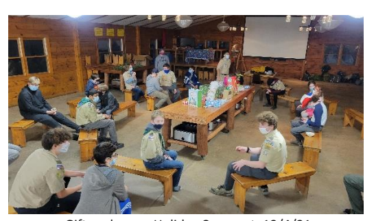
Gift exchange, Holiday Campout, 12/4/21