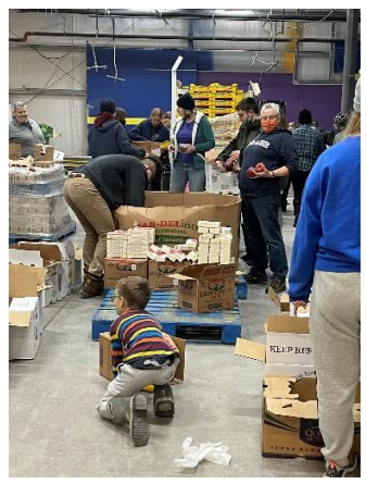
Centre County YMCA food packing, 11/20/21