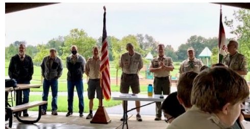
ASMs, Court of Honor, 8/31/21