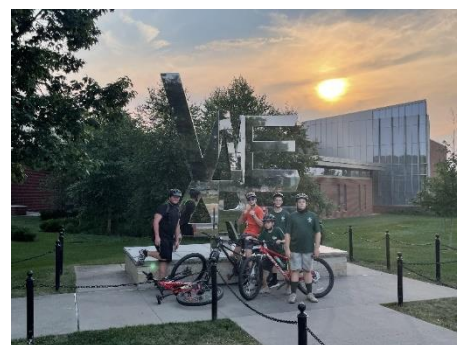
Bike Scavenger Hunt, 7/27/21